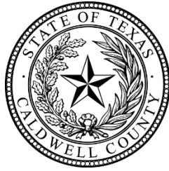
EXHIBIT A Caldwell County Commissioners Court Public Participation Form

County Commissioners Court Citizens' Comments: At this time any person may speak to Commissioners Court if they have filled out a Caldwell County Public Participation Form. Comments will be limited to four (4) minutes per person. No action will be taken on these items and no discussion will be had between the speaker(s) and members of the Court. The Court does retain the right to correct factual inaccuracies made by the speakers. (If longer than 30 minutes, then the balance of comments will continue as the last agenda item of the day).